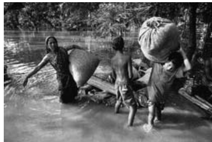
Floodwaters continue to rise in the villages.

Please pray for LHCB, the staff and their families, for the villagers we serve in Madaripur, Barisol and Golpanj districts, and for all the people of Bangladesh, India and Nepal who are suffering during this time of flooding and recovery.