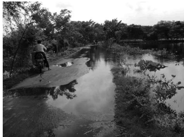
Flooded roads near Dumki make travel difficult.